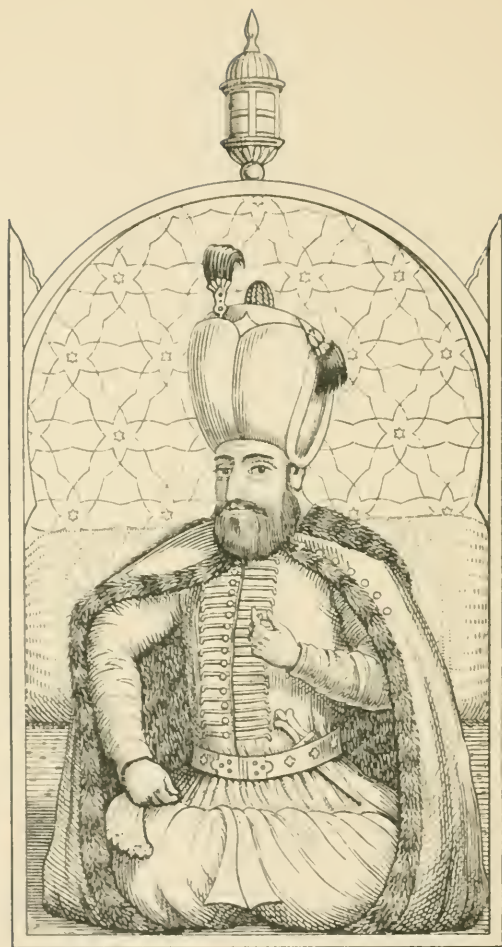
MURĀD SULTAN MURĀD IV